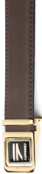
PB 0817 30mm, Reversible