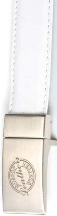
PB 0932 35mm Reversible buckle