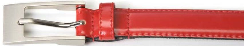
PB 0883 25mm Ladies, full colours