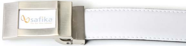
PB 0906 35mm